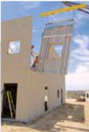
One of several facilities constructed at the U.S. Army's National Training Center in Fort Irwin, CA that will incorporate new environmentally-friendly Ecolite wall panels.

The new Ecolite wall panels are prefabricated, noncombustible solid wall panels made from 50 percent recycled materials that emit no volatile organic compounds, and the small volume of concrete used reduces carbon dioxide emissions. Better yet, the new wall panels qualify for four different LEED categories. The wall system weighs approximately 400 percent less than conventional precast concrete wall systems.